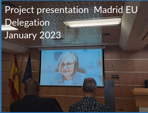
Project presentation Madrid EU Delegation January 2023