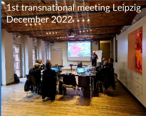
1st transnational meeting Leipzig December 2022