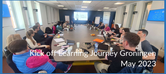
Kick off Learning Journey Groningen May 2023